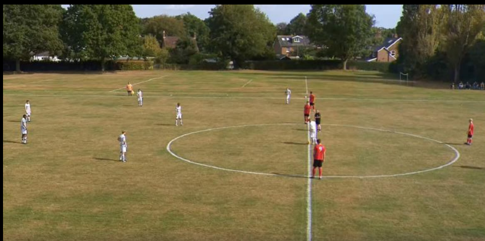
Ifield v Nutley 16-Sep-23

The squads are all a healthy size and spirits are high. We hope they all have a lot of fun. You can watch some recent matches recorded on the VEO on the links below.