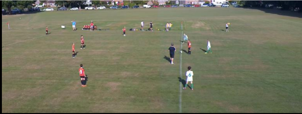
Nutley v Rotherfield 16-Sep-23